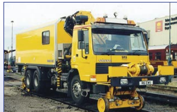
The single most valuable item stolen in 2006 - a 25 tonne Volvo road rail lorry, worth £300,000

In general, the south east of the UK retains its place as the worst region for equipment theft in the UK - London, Surrey, Thames Valley and Kent topping this list.